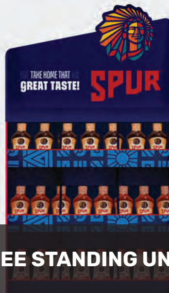
FREE STANDING UNITS