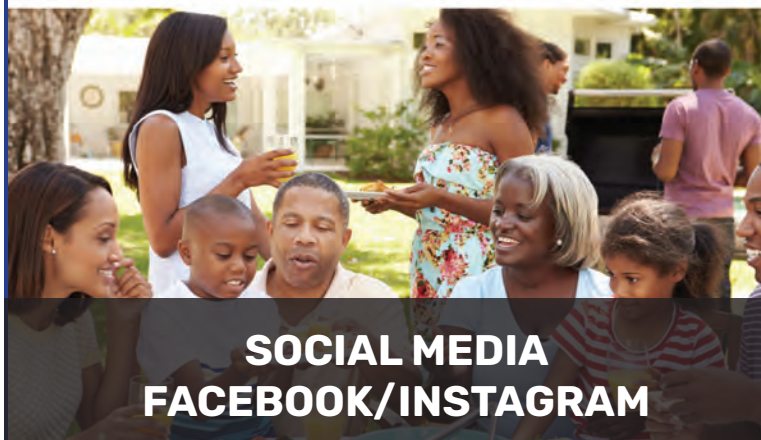
SOCIAL MEDIA FACEBOOK/INSTAGRAM