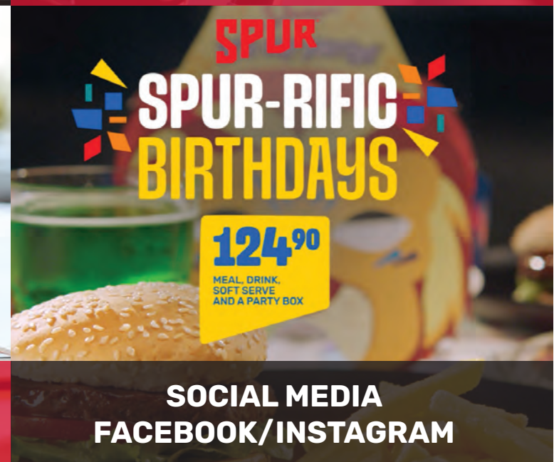
SOCIAL MEDIA FACEBOOK/INSTAGRAM